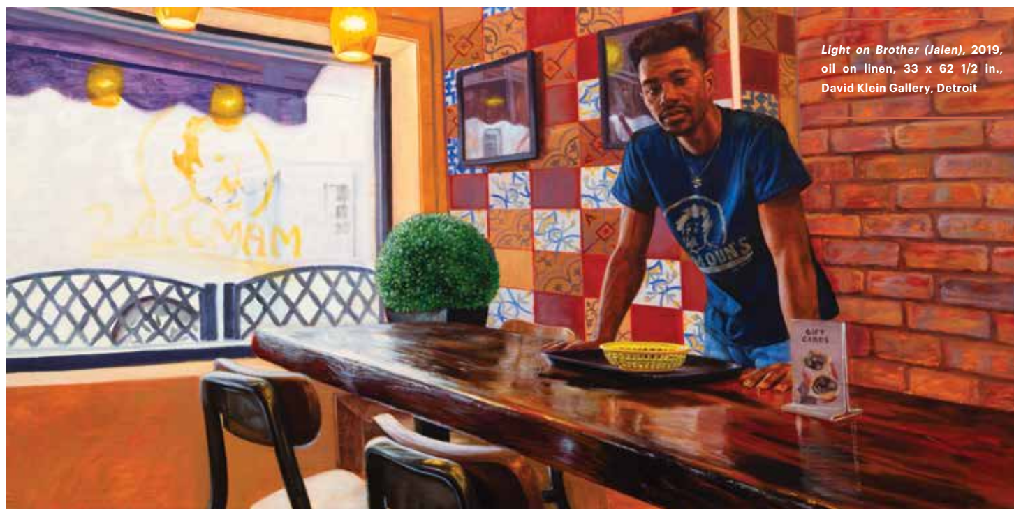
Light on Brother (Jalen) , 2019, oil on linen, 33 x 62 1/2 in., David Klein Gallery, Detroit