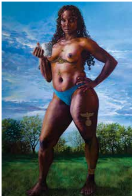
(LEFT) Supreme Green Grass , 2016, oil and gold leaf on linen, 72 x 48 in., courtesy of the artist ■ (BELOW) A Student’s Dream , 2017, oil on canvas, 68 x 80 in., private collection

In 2011 Moore enrolled in Yale University’s M.F.A. program in painting. He mounted his first solo show across the street from the art school at a boutique hotel called The Study at Yale. “That went really well,” he recalls. “The hotel owner