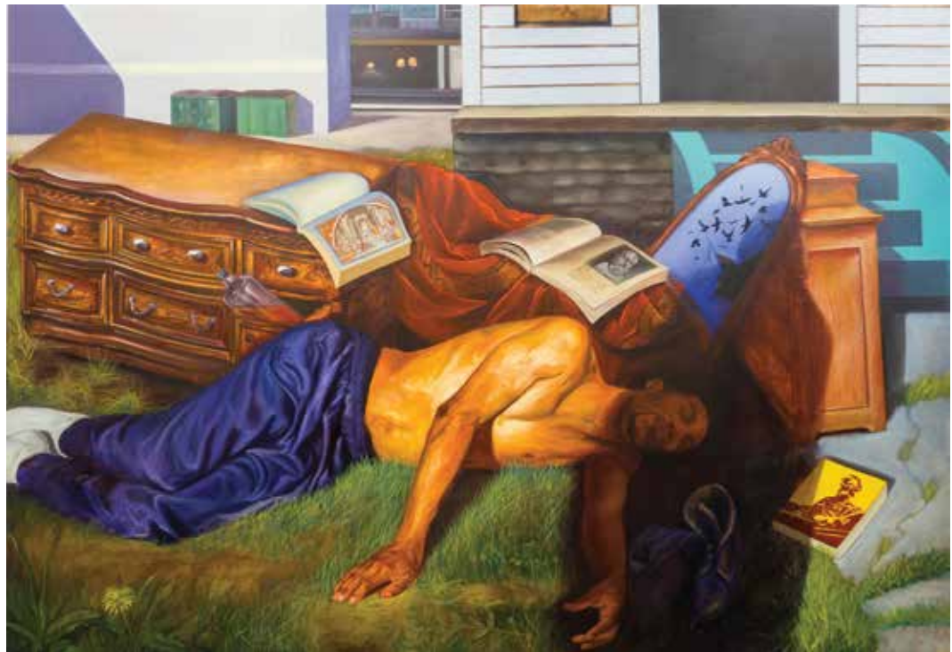
Marcus Garvey Knew, 2012, oil on canvas, 60 x 84 in., private collection, courtesy of the artist