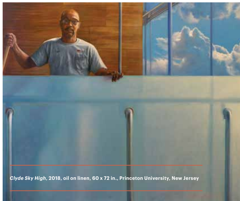
Clyde Sky High , 2018, oil on linen, 60 x 72 in., Princeton University, New Jersey